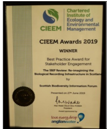
CIEEM Awards 2019 to SBIF Review : Spot the red heads!