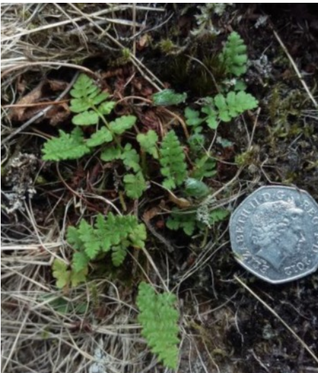
Oblong woodsia Woodsia ilvensis

Over the next year or so, the John Muir Trust is aiming to assess the feasibility of a mountain woodland creation project on Schiehallion. This will again involve thorough habitat and vegetation surveys of the site, to identify areas of the hill most suitable for grazing protection and upland tree planting. I am leading on the site feasibility study, so the training gained through the bursary will be invaluable for this.