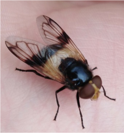
Pellucid HoverFly Volucella pellucens

Recording and identifying hoverflies is very challenging. However, it can provide invaluable information regarding not only the distribution and ecology of individual species but also leads to more complex data with implications in understanding issues such as landscape connectivity or the effects of climate change.