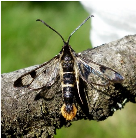
Welsh clearwing ( Synanthedon scoliaeformis )

Best wishes, and good recording for the rest of 2019