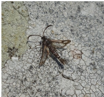
Thrift clearwing ( Pyropteron muscaeforme )