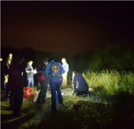
Moth trapping at Stevenson Beach LNR

We have also created Citizen Science projects specifically designed to appeal to anyone with an interest in nature to provide an easy way to get involved in wildlife recording.