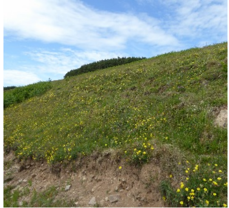
A good bank of flowering Rock-rose Helianthemum nummularium

What happens next? The survey needs to continue at least through 2019, which will hopefully allow the bulk of the remaining sites to be visited. In addition, some work will be done to discover new sites – based on exploring areas where Rock-rose has been recorded. This has already happened to a limited extent in 2018, with some successes. As the survey gets completed a dossier of sites will be prepared and this will be promoted through agencies such as the planning authority and forestry organisations so that the information can guide future developments and avoid the destruction of or damage to Northern Brown Argus colonies.