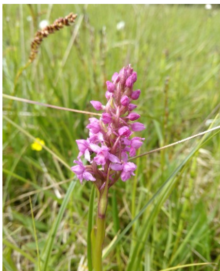
Heath Fragrant Orchid Gymnadenia borealis