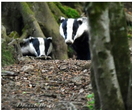
Badgers, East Ayrshire

It's almost two years since the former Dumfries & Galloway Environmental Resources Centre (DGERC), evolved into the South West Scotland Environmental Information Centre's (SWSEIC). This was facilitated by the expansion of the records centre to include Ayrshire via the 'Where's Wildlife in Ayrshire?' project.