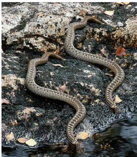
Adders (John Donaldson)

During the project we have provided developed a new website, including online recording forms. We have also provided 34 training courses to train approximately 300 people to record Ayrshire's fantastic wildlife! Our courses have taken us all over Ayrshire, we have worked with both beginners and very experienced recorders to learn more about many difference species/taxa including: amphibians, reptiles, butterflies, dragonflies, wildflowers, hoverflies, bats,