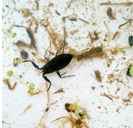
Water scorpion Nepa cinerea

Although a generalist at heart with a desire to learn something about everything, a large part of my traineeship is focused on freshwater invertebrates. I assist with a public engagement project called 'Marvellous Mud Snails' which aims to raise awareness of the rare Pond mud snail