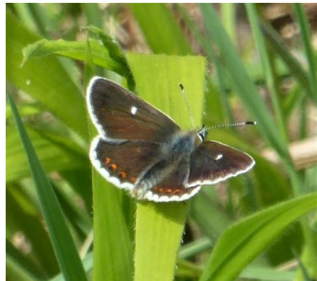
Northern Brown Argus in its full beauty

However, despite this apparently satisfactory situation, the Northern Brown Argus is in trouble and as well being a UK BAP priority species it is on the Scottish Biodiversity List and has been a conservation priority for Butterfly Conservation for at least the past twenty years. The reason? It is in decline mainly through habitat loss. The caterpillars are reliant on Common Rock-rose Helianthemum nummularium as their sole food-plant and this