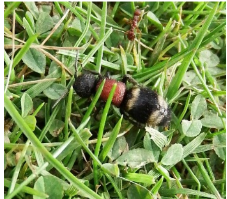
Mutilla europaea in centre and 'normal' ant above

They are not ants but parasitoid wasps preying mainly on bumblebees and honeybees. As the females are wingless they could be mistaken for ants, but the photo shows how much smaller a "normal" ant is.