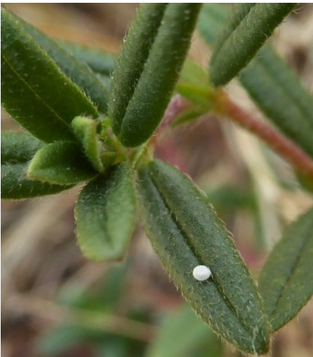
Conspicuous egg of Northern Brown Argus