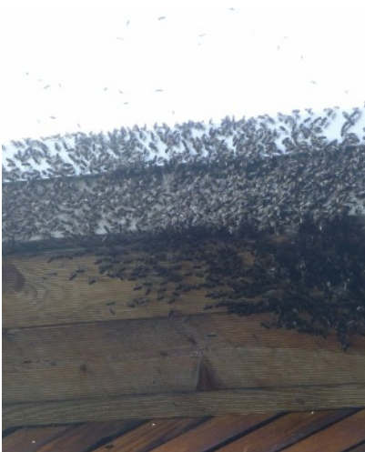
The honeybee swarm on the gable soffit July 2018