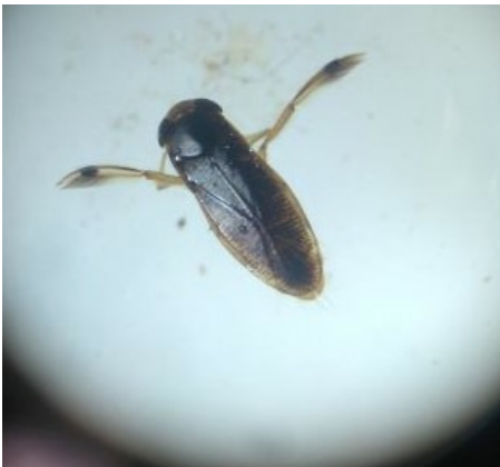
Lesser Water Boatman Callicorixa praeusta

had refined the art of handling and manoeuvring tiny, delicate bugs underneath a microscope (almost).