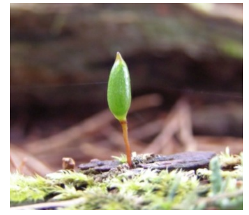
Buxbaumia viridis

viridis was recently discovered very close to the Lodge itself. Other mosses of note across the estate include Schistidium trichodon, known to occur frequently only on the crags of another NTS property, Ben Lawers, and