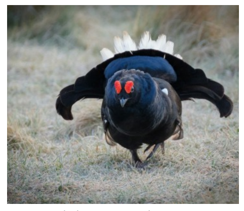
Black Grouse

Mar Lodge Estate is also well-known for its birds of prey. Eleven species of raptors and owls were recorded