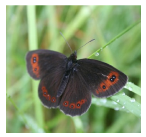
Scotch Argus

With so many insects on the books the collection of these records is down to a huge number of recorders, to whom we