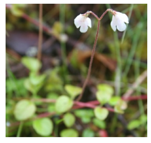
Twinflower Linnaea borealis

The most exciting botanical stories are evolving at a landscape scale. Much of our ecological work has been focussing on the reserve's Caledonian pinewood, one of the most iconic Scottish habitats. When NTS took on the site in