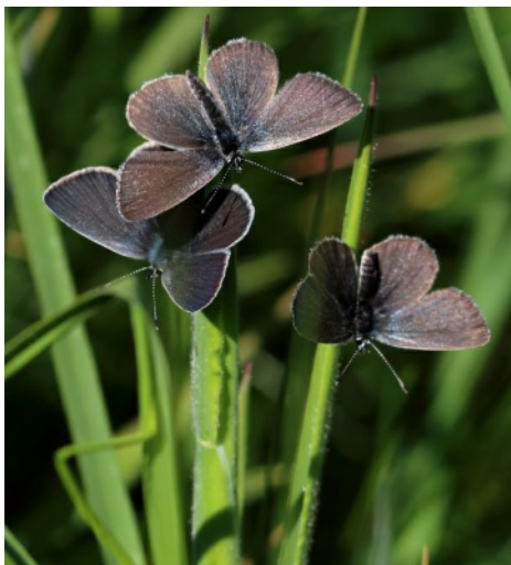
A group of Small Blues

The Small Blue continues to inhabit the Berwickshire coast, a clear decade after the species was rediscovered. This was after fears before 2007 that it had