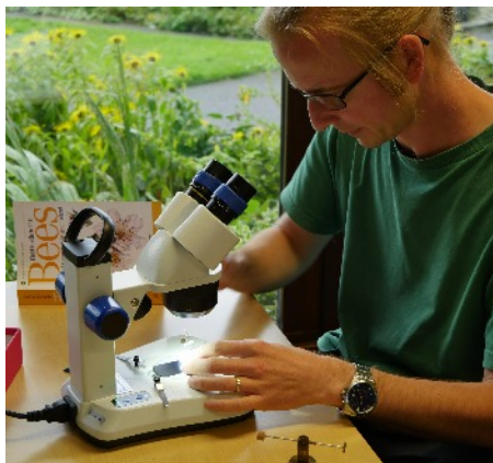
Learning to identify bees with the aid of a microscope

Light drizzle, grey clouds scudding by on a brisk breeze and not a buzz to be heard. An August day in the Lake District. The weather forecast was more of the same with the possibility of some sunshine on Sunday. However, the views looking south from the FSC centre at Blencathra over the fells compensated for the less-than-perfect weather for the participants on the Bee Id Workshop.