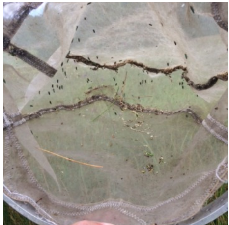
Collecting samples using sweep nets

At the time of the training course, I had just finished my Natural Talent Traineeship with The Conservation Volunteers and SASA (Science & Advice for Scottish Agriculture) and was focusing on improving my invertebrate ID skills. During my time at SASA, I first became aware of Auchenorrhyncha (hopper species) significance in agriculture as vectors of emerging plant diseases such as Xylella fastidiosa . Accurate identification of hoppers is crucial for monitoring both insect-vectored pathogens and local biodiversity. With only a few hopper specialists in Britain, it highlights the importance