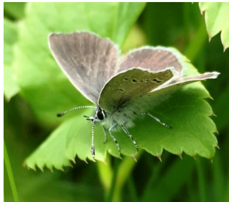
Figure 1. Small Blue Butterfly

Scotland's first Scottish "Small Blue week" took place from 29th May to 4th June 2017. The Small Blue (Fig.1) is the UK's smallest butterfly and has declined in numbers both nationally and locally over recent decades.