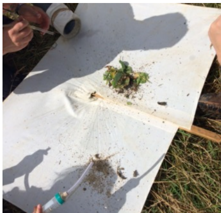
Collecting samples using pooters

of engaging people in the taxonomy of lesser known taxa.