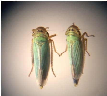
Cicadella viridis leafhoppers

local nature reserves: Llanymynech (an old quarry site with rich flora found within the grassland beneath the cliff) and Sweeney Fen (a protected wetland home to marsh-loving hoppers such as Cicadella viridis ). It was another great day out in the field, and our group managed to collect a large diversity of species.