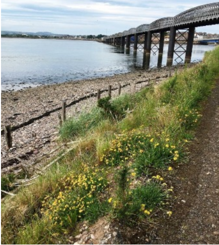
Fig 3. A very small, isolated patch of kidney vetch on Rossie Island, Montrose "rediscovered" in 2016 and surveyed for small blue in 2017. ©KAD

at a site in central Angus. Increased survey effort has allowed recording of populations, of both species, in sites that haven't been surveyed for some time (Fig.3). Plans are now to supplement the Kidney Vetch on sites to ensure that small, fragmented populations can persist.