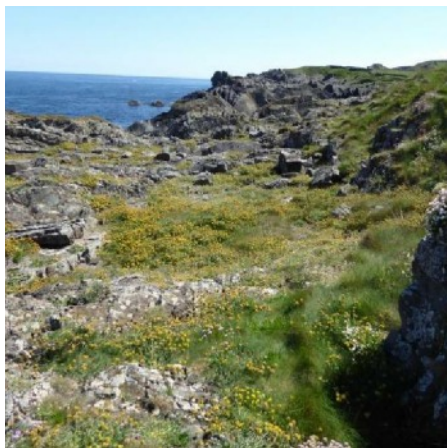
Suitable habitat along the Berwickshire coast

Much has been learned during 10 years regarding this butterfly. One thing more than anything else has been the length of the flight period. On average the Small Blue butterfly emerges mid-May and peaks early June. In 2017 a