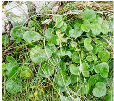
Common scurvy grass ( Cochleria officinalis )

Another informative BRISC conference very efficiently and comfortably hosted by the FSC, Millport. I heartily recommend the place for its facilities, its courses and for the wildlife which you can help record.