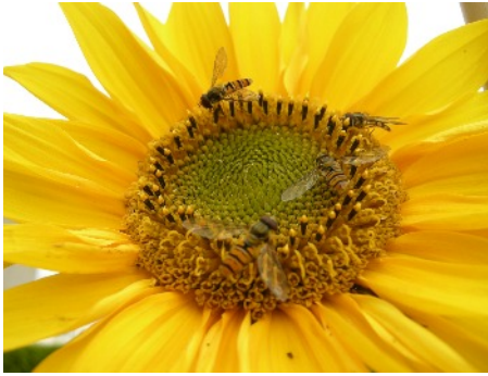
Hoverflies on sunflower (2011)

shoulders". The shoulders referring to the humeri which look a bit like shoulder pads on the thorax of the hoverfly. The presence or absence of hairs on these sets you off on the key.