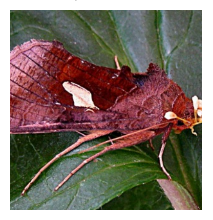
A Gold Spangle moth caught in a Greater Butterfly orchid meadow with 9 club like pollen masses of the orchid attached to it's compound eyes .... Just as Charles Darwin predicted.

species were re-found and the 80 that were lost were all native plants like Yellow Star of Bethlehem, Early Purple Orchid, Wild Pansies, Agrimony, Mullein, Sweet Violets etc. More than half the new records were non-natives like Spanish Bluebell, Daffodils, Red Currant, Pirri Pirri Burr, Leopard's-Bane, Sitka Spruce etc.