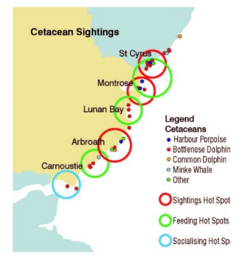
Fig. 1 Cetacean sightings, feeding and socialising hotspots have been identified on the Angus coast. The occurrence of particular species shown allows land based watchers to identify spots of particular interest to them.

simple snapshot of behaviours and also human encounters with species can be seen below.