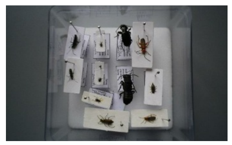
The start of a reference collection.

knowledge. I have left confident in being able to identify beetles down to family level. But with 4000 species in the UK it a daunting task to become an expert in identifying all species. There is no one book that covers all beetles, but many books dedicated to particular families.