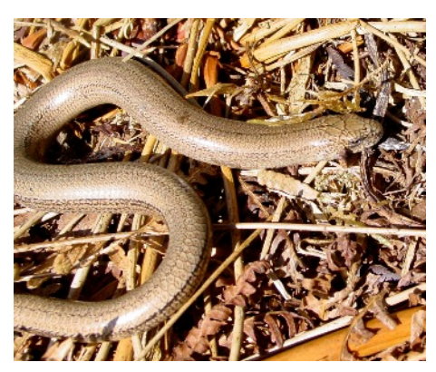
Fig. 1 Adult male slow-worm and juvenile adder, revealed under an artificial cover object (ACO), March 2012, Loch Lomond.

This initial success encouraged me and I learnt to visit the site when most likely to find reptiles, typically 7-10am on sunny days. The site was monitored about once a week, until late October, when no reptiles were seen, as animals had entered hibernation. In total I made 36 visits in 2012, with the results described in McInerny (2014a).