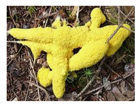
Fiulio septica or Dog Vomit slime mould.

The focus was the Myxomycetes, a.k.a. slime moulds; a specialist area of the course leader. We began the weekend with an introductory evening session where I learned that slime moulds were neither moulds nor slimy. They weren't unattractive either. The first field trip was an awakening. We never ventured more than a couple of minutes' walk from the field centre and found a whole range of microfungi without effort. A frequently used x30