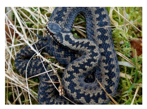
Fig. 2 Adult male adder, February, Loch Lomond

[Editors note - the graphs of the reptile counts are difficult to display here. They can be seen in detail in McInerny 2016b].