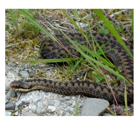
Fig. 3 Adult female adder July, Loch Lomond Continued on page 5

Increasing numbers of adders were counted during the study period, from a minimum 40 individuals in 2012, to a maximum 148 in 2015 (Figs. 2,3). This included a record day count of 26. In total over 200 different adders were recognised by their head patterns, which are unique to each individual, during 2012 to 2015. Large numbers of slow-worms were also counted, with a minimum 77 day counts in 2015 to a maximum 149 in 2013; and smaller numbers of common lizards,