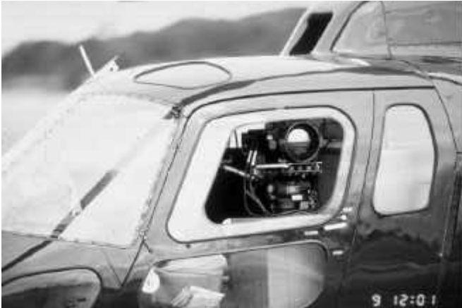
Thermal imaging camera used for surveying common seals.

platform that rocks backwards and forwards to compensate for the forward motion of the aircraft. This has made it possible to use lower shutter speeds and to move from black-and-white film to colour. The resulting photographs are much easier to interpret and, in theory, it is possible to measure the length of a seal in one of these photographs to an accuracy of \pm 5 cm! Some colonies are difficult to survey from the air because they are underneath steep cliffs or in caves, and these are counted on the ground whenever there is an opportunity.