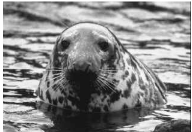
An adult female grey seal at the Isle of May.

(SMRU) at the University of St Andrews to monitor the British describes how that monitoring is done and provides a brief summary of the current status of the two species in Scotland.